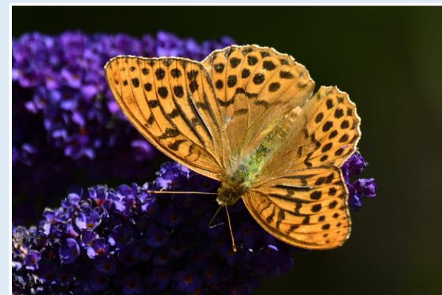
Silver Washed Fritillary in central Churt