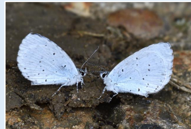
Holy Blue butterflies in central Churt