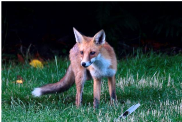
Mr Fox checks for snacks

There were so many great photos for the Summer edition that we have included a second page. See www.churtzero.org for more news