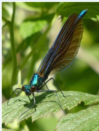
Beautiful Demoiselle Damselflies-female and male