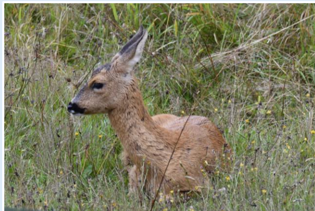
Time for a lie down – those two fawns are hard work!