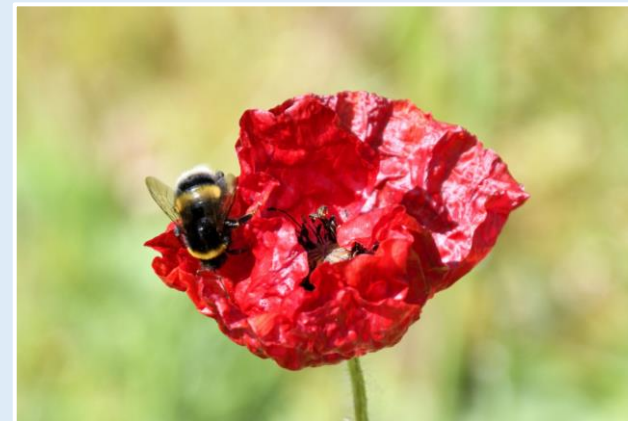
The Bumblebees loved the poppies