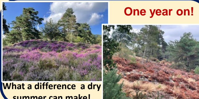
What a difference a dry summer can make!