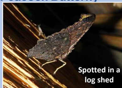
Spotted in a log shed

Most butterflies hibernate as an egg, pupa or caterpillar. But the Peacock can hibernate as an adult.